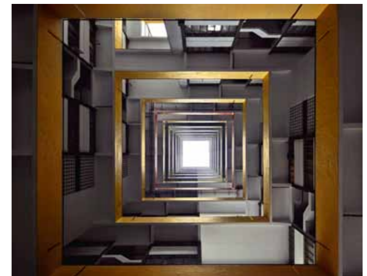
'This residential building in the New Territories has a unique style of architecture. I don't have a specific way to select buildings – I simply look up as much as possible, and when I see a pattern that catches my attention, I shoot.'