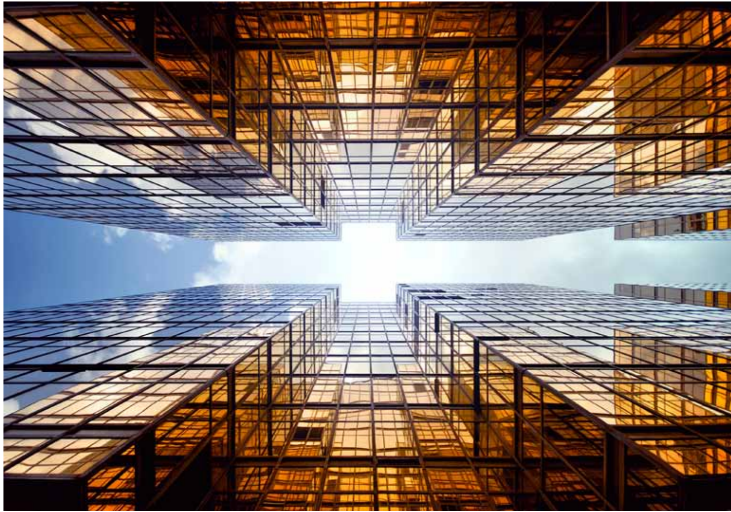
'On the Kowloon side, Canton Road is a shopping paradise for many tourists, as well as their temporary home, thanks to its plentiful selection of hotels. The China Hong Kong City complex, pictured here, is probably trying to attract people who have a crush for gold.'