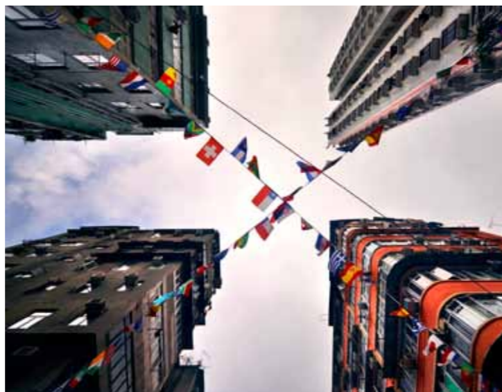
'Temple Street Market welcomes tourists every day and night from all over the world, like the flags that are hung above the crossing with Nanking Street. There's all kinds of bargains here, from electronic goods to counterfeit fashions.'