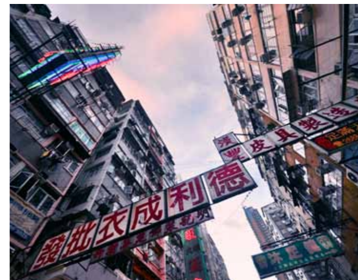
'Fuk Wa Street is in Sham Shui Po, at the north end of Kowloon. It's one of the oldest residential districts of Hong Kong, characterised by its comparatively low-rise architecture, with a lot of markets and shops at street level.'