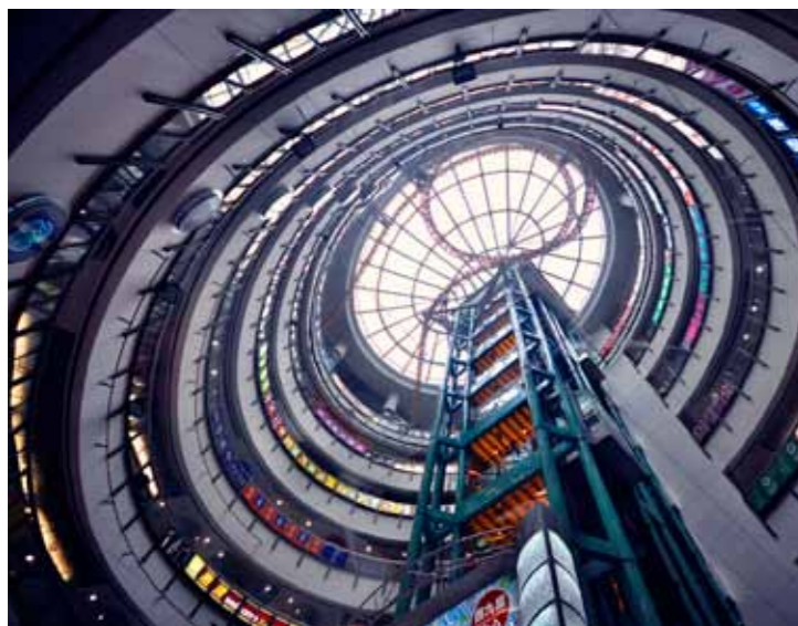
'This traditional shopping centre has a very different atmosphere to the modern ones that look the same everywhere in the world. It has a roller coaster on the top floor. Unfortunately it's not running, probably for safety reasons.'